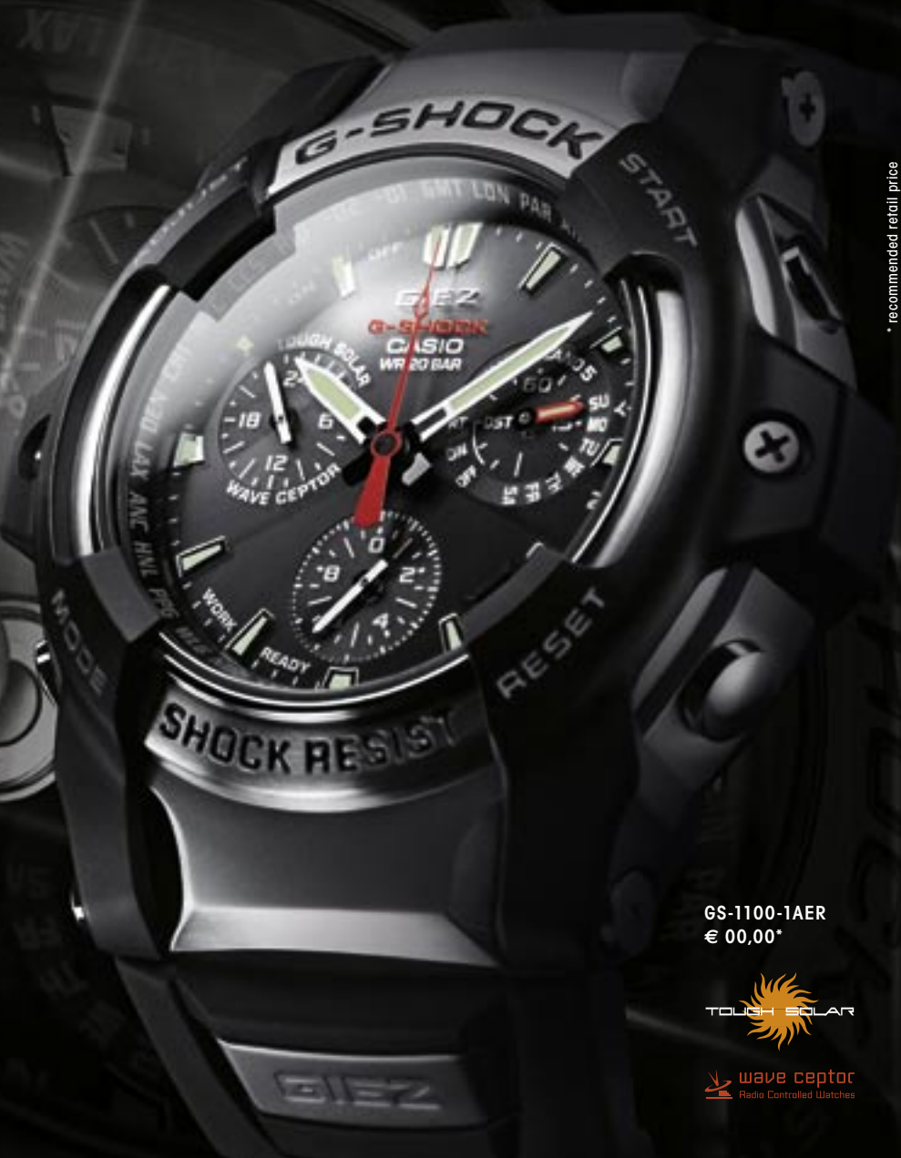
GS-1100-1AER € 00,00*