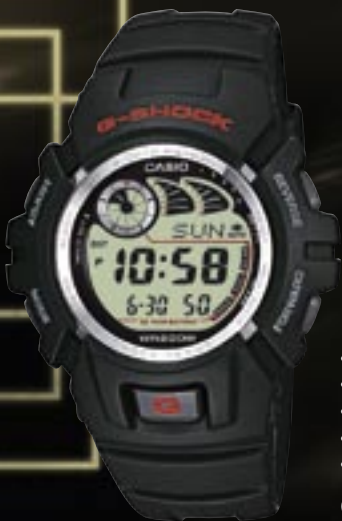
G-2900F-1VER € 00,00*