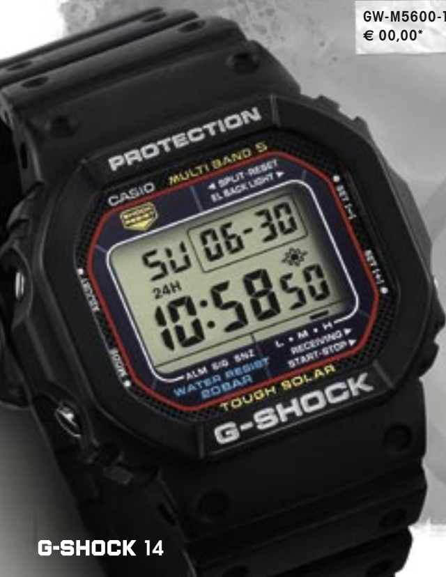
GW-M5600-1ER € 00,00*