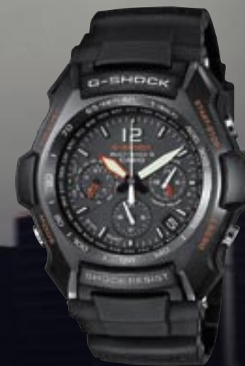
GW-2000B-1AER € 00,00*