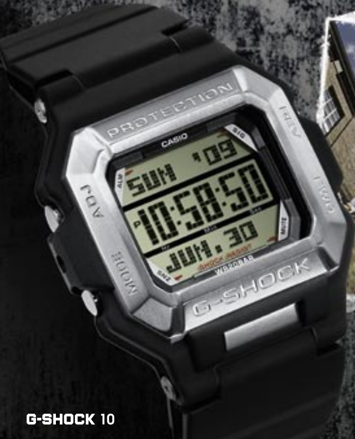
G-7800-1ER € 00,00*