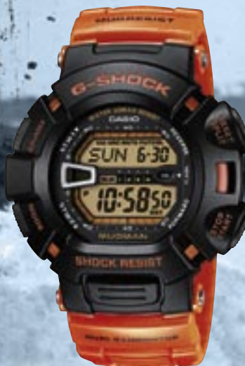
G-9000R-4ER € 00,00*