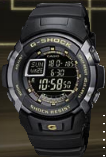
G-7710-1ER € 00,00*