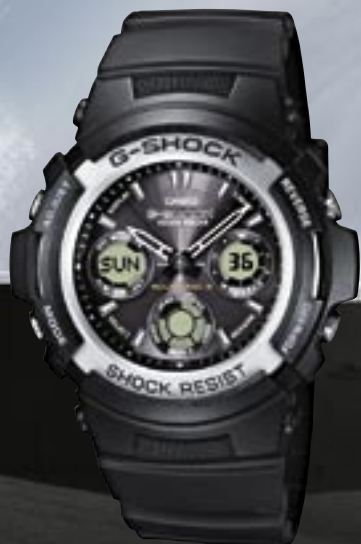
AWG-100-1AER € 00,00*