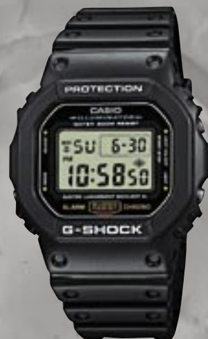
DW-5600E-1VER € 00,00*