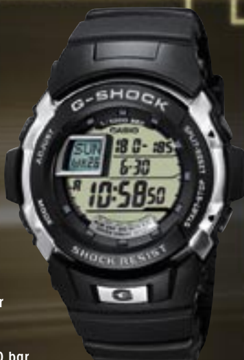
G-7700-1ER € 00,00*