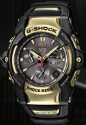
GS-1100B-9AER Gold ion plated case € 00,00*