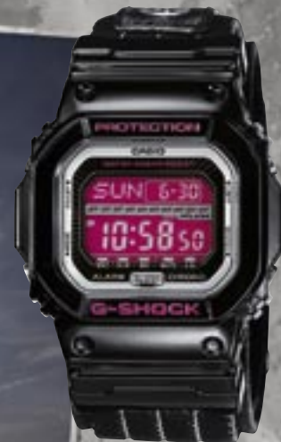
GLS-5600V-1ER € 00,00*