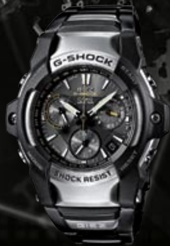
GS-1100D-1AER Black ion plated band € 00,00*