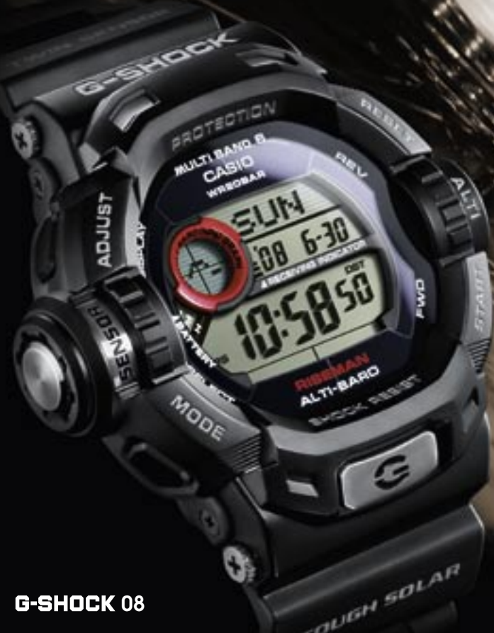
GW-9200-1ER € 00,00*