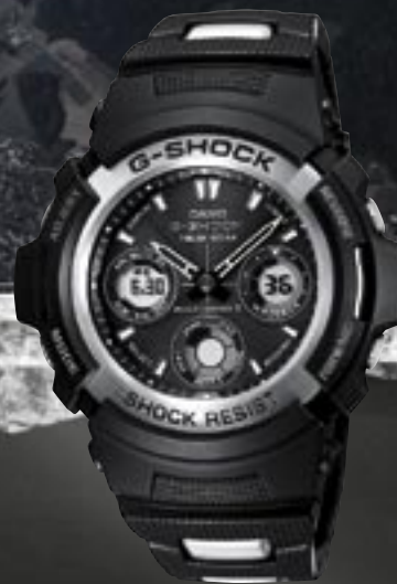
AWG-100C-1AER € 00,00*