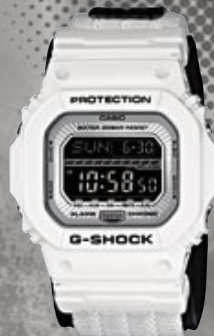
GLS-5600V-7ER € 00,00*