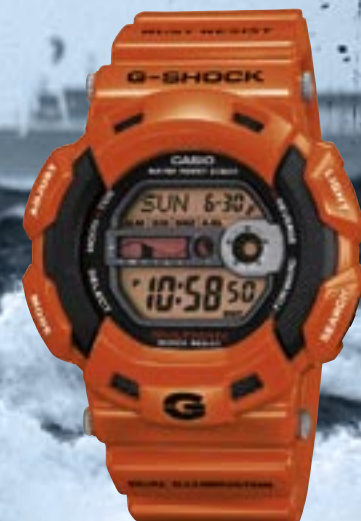
G-9100R-4ER € 00,00*