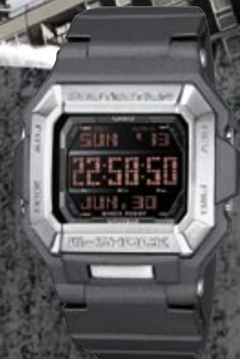
G-7800B-8ER € 00,00*