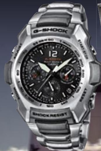
GW-2000D-1AER € 00,00*