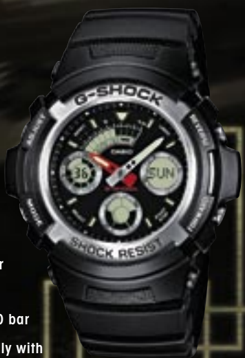
AW-590-1AER € 00,00*