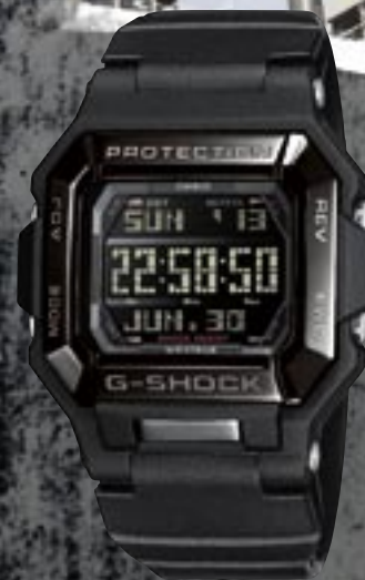
G-7800B-1ER € 00,00*