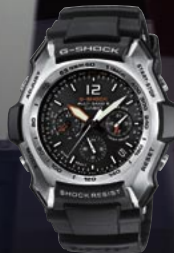
GW-2000-1AER € 00,00*