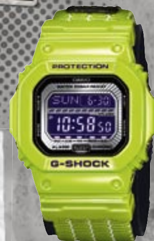
GLS-5600V-3ER € 00,00*