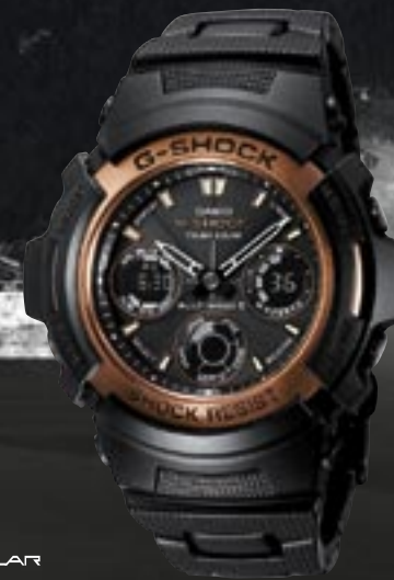
AWG-100BR-1AER € 00,00*