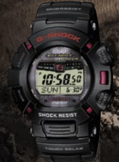
GW-9010-1ER € 00,00*

The GW-9010's rally timer displays a stopwatch and countdown timer at the same time – perfect for use in professional racing.