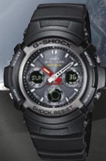
AWG-101-1AER € 00,00*